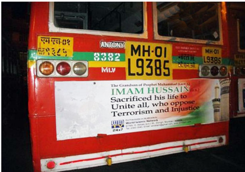
Figure 1. The Muharram Awareness Campaign banner in English on a city bus, Mumbai 2011 (World Islamic Network 2012).

In Muharram 2010/2011, World Islamic Network placed an image of the golden minarets of Imam Hussain’s magnificent tomb in Karbala juxtaposed with the iconic Taj Mahal Hotel, the main target of the terrorist attacks in Mumbai on November 26, 2008, on its website, as well as on large street billboards, advertising panels on Brihan-mumbai Electric Supply and Transport Undertaking (BEST) public buses and local trains (see figures 1 and 2), and digital advertising banners in large cities across India. In not targeting predominantly Shi’ite or even Muslim localities, the campaign is clearly directed at a wider national audience. In between the images of the Taj Mahal Hotel and the golden minarets of Karbala, the colors of the Indian flag create a blur, providing the visual background for the statement, “The Grandson of the Prophet Muhammad (s.a.w.s.) Imam Hussain (a.s.) sacrificed his life to unite all who oppose terrorism and injustice” (see figure 3). The image was also reproduced with the slogan in Hindi written in Devanagari script (see figure 4). Not just the choice of language, but the rather purist, Sanskritized register employed clearly indicates the addressing of a non-Muslim public. Casting Shi’ite Muslims as ideal representatives of a “Muslim