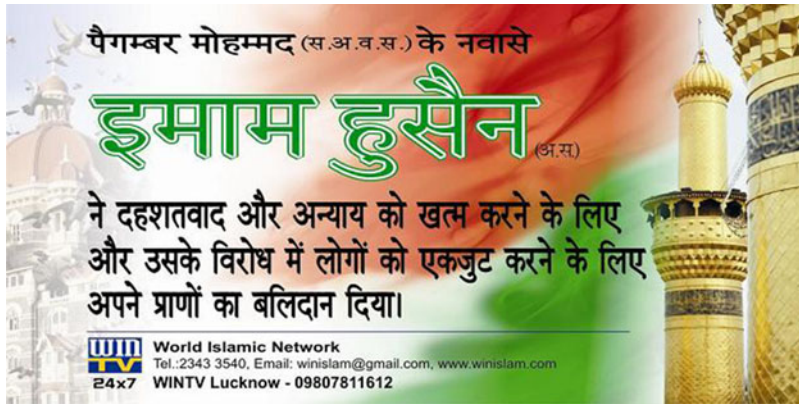
Figure 4. The Muharram Awareness Campaign banner in Hindi (World Islamic Network 2012).

resistance and sacrifice in the face of oppression or other injustices against overwhelming odds. The narrative of Karbala has been mobilized in Indian nationalist struggles and reform politics (Hyder 2006); to repel a powerful invader through guerilla combat, such as more recently by Hezbollah in Lebanon; or to topple a powerful dictatorial government, as happened during the Islamic Revolution in Iran, and has more recently again been mobilized by supporters of the “green movement” in their protests against the government of the Islamic Republic of Iran (Fischer 2010). Especially the latter appeals to the story of Karbala exemplify the more revolutionary and activist shift the Karbala paradigm underwent before and after the Iranian revolution in some parts of the Muslim