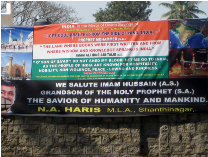
Figure 5. Quotes on India from the Prophet Muhammad, Imam Ali, and Imam Hussain, Bangalore 2009.

resistance and sacrifice in the face of oppression or other injustices against overwhelming odds. The narrative of Karbala has been mobilized in Indian nationalist struggles and reform politics (Hyder 2006); to repel a powerful invader through guerilla combat, such as more recently by Hezbollah in Lebanon; or to topple a powerful dictatorial government, as happened during the Islamic Revolution in Iran, and has more recently again been mobilized by supporters of the “green movement” in their protests against the government of the Islamic Republic of Iran (Fischer 2010). Especially the latter appeals to the story of Karbala exemplify the more revolutionary and activist shift the Karbala paradigm underwent before and after the Iranian revolution in some parts of the Muslim