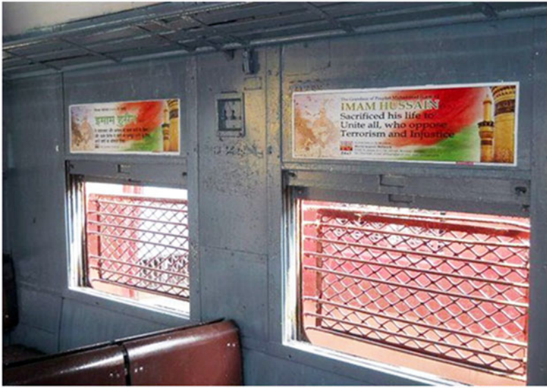
Figure 2. The Muharram Awareness campaign banners in English and Hindi in a local train, Mumbai 2011 (World Islamic Network 2012).

community” and also aimed at non-Muslims, the campaign sends an annual ecumenical message portraying Shi‘ite Muslims as people whose moral values and leaders make them exemplary Indian citizens, committed to serving the nation, furthering communal harmony, and through the tragedy of Karbala representing the world’s original victims of terrorism. In opposing Shi‘ite Muslims to a terrorist other, the makers of the campaign not only sought to strengthen the nationalist credentials of Shi‘ite Muslims but also shifted their discourse towards speaking for a more universal humanity, in uniting “all” who reject terrorism, and in inhabiting a more generalized voice of its victims. Seen from this perspective, this strategy thus also counters contemporary globally operating terrorists’ appeals to “humanity” (see Devji 2009) on similar terrain.